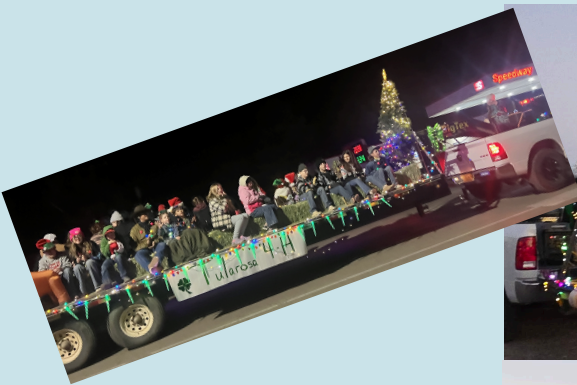
The Tularosa 4-H Club participated in the Tularosa parade in December. The kids had a blast and decorated an amazing float!