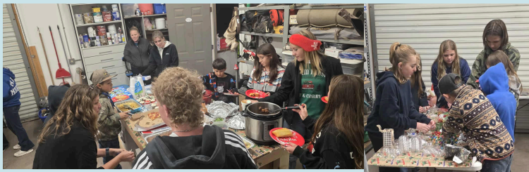
Tularosa 4-H Christmas party, Crafts, Food, & Fun!